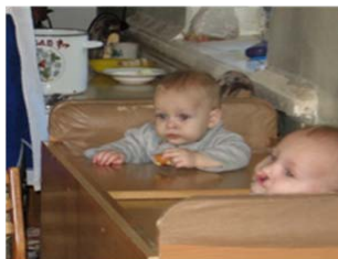
Age 18 months at Baby House #1 in Kemerovo, Sept.2006