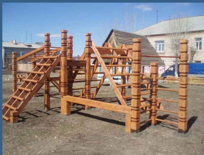
New play structure for Kizil orphanage.

Our Orphanage Assistance program is delivered through our agents in Russia and travelling family volunteers. Thanks to the families that helped with the purchase of these items! If you are interested in helping us on your next trip to Russia or if you know of a family that can help out, please contact marie@helpingorphans.ca .